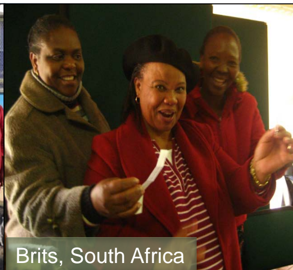
Brits, South Africa